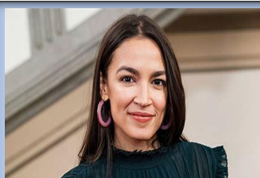
Alexandria Ocasio-Cortez aka AOC

While the Voting Rights Act of 1965 included a section that ensured that people educated in US schools that were predominately taught in a language other than English – for instance, island Puerto Ricans – could not be denied the right to vote because of their inability to read, write, understand, or interpret material in English, Spanish-speakers in the contiguous US, including mainland Boricuas, were often still discriminated against at the polls. This changed on August 6, 1975, exactly one decade after the Voting Rights Act of 1965, when, following several court battles on behalf of Latino-Americans, President Gerald Ford amended the act to also end discrimination against so-called “language minorities.” Protecting the voting rights of Latinos, as well as non-English-speaking Asian Americans and Native Americans, made it possible to translate registration materials into other languages and strengthened the political power of communities of color.