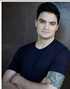
Felipe Neto Rodriguez Vieira

Latin Americans, some of the most influential people in the world (Time Magazine)